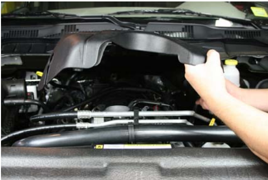
STEP 4 REMOVE INTAKE COVER