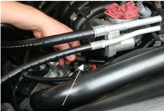
STEP 6 REMOVE PCV HOSE