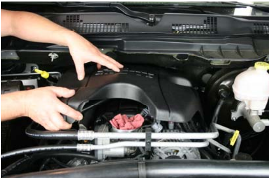
STEP 18 REINSTALL INTAKE COVER