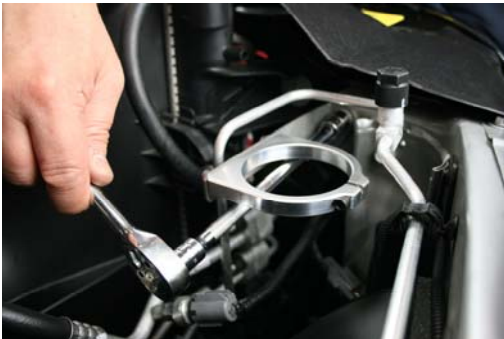
STEP 10 INSTALL STAINLESS BRACKET AND BILLET CLAMP