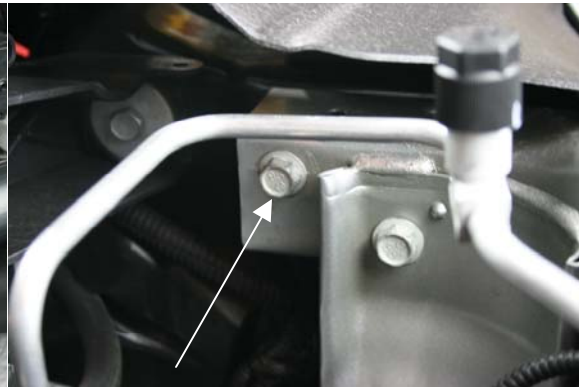
STEP 7 LOCATE MOUNTING BOLT ON RADIATOR SUPPORT PASSENGER SIDE

For Technical Assistance, call Moroso's Tech Line (203)-458-0542, 8:30am-5:00pm Eastern Time MOROSO PERFORMANCE PRODUCTS, INC.