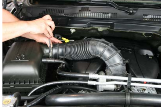
STEP 19 REINSTALL AIR INTAKE TUBE

For Technical Assistance, call Moroso's Tech Line (203)-458-0542, 8:30am-5:00pm Eastern Time MOROSO PERFORMANCE PRODUCTS, INC. 80 CARTER DRIVE GUILFORD, CT 06437 www.moroso.com