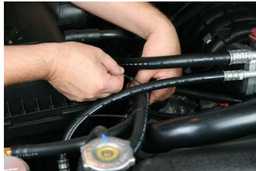
STEP 17 WIRE TIE 29" AND 36" HOSE TOGETHER