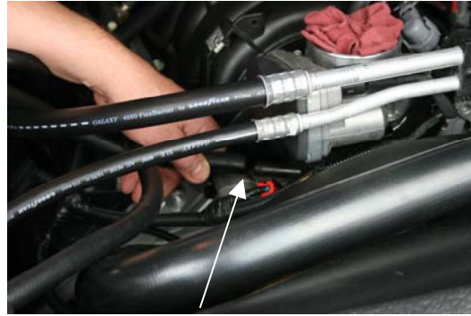
STEP 15 INSTALL 29" HOSE