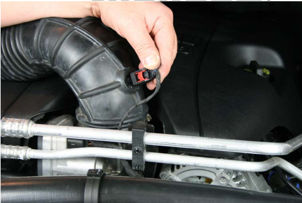
STEP 20 REINSTALL SENSOR