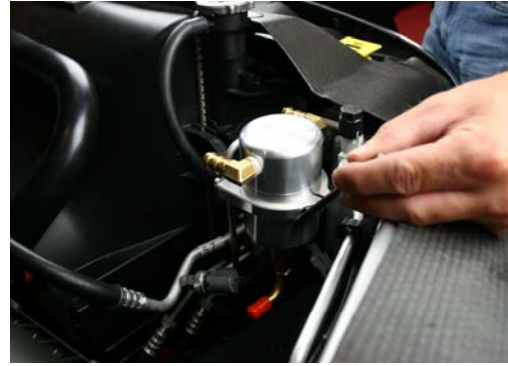
STEP 12 INSTALL AIR/OIL SEPARATOR INTO BILLET CLAMP