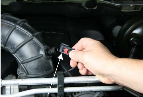
STEP 2 UNPLUG SENSOR