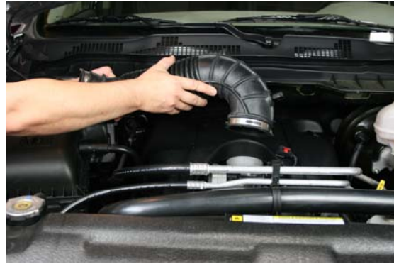
STEP 3 REMOVE AIR INTAKE TUBE