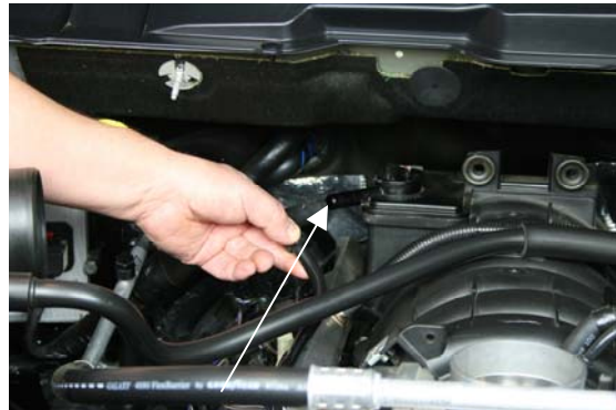
STEP 5 REMOVE PCV HOSE