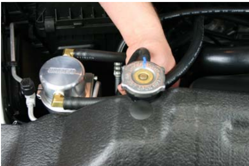
STEP 16 INSTALL 29" HOSE TO AIR OIL SEPARATOR