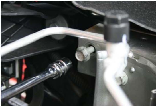
STEP 8 REMOVE MOUNTING BOLT