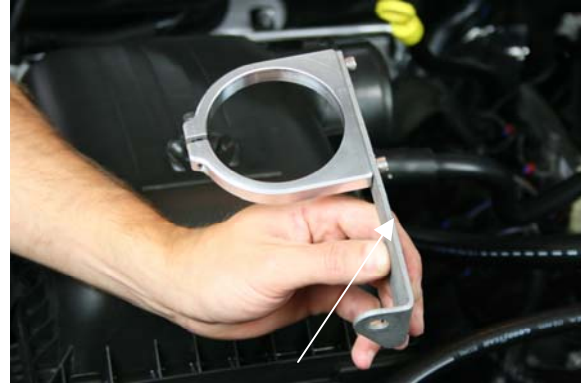
STEP 9 ASSEMBLE STAINLESS BRACKET AND BILLET CLAMP AS SHOWN (NOTE FLAT SIDE OF STAINLESS BRACKET)