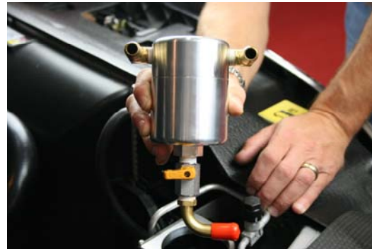
STEP 11 ASSEMBLE TANK BODY (NOTE ORIENTATION OF FITTINGS AND BALL VALVE) (APPLY TEFLON TAPE TO ALL FITTINGS)

For Technical Assistance, call Moroso's Tech Line (203)-458-0542, 8:30am-5:00pm Eastern Time MOROSO PERFORMANCE PRODUCTS, INC.