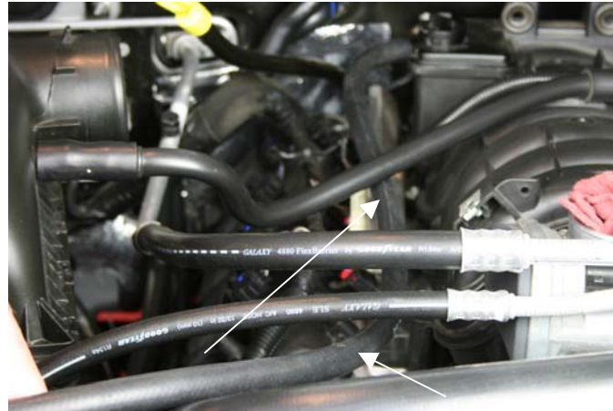
STEP 13 INSTALL 36" HOSE ROUTE AS SHOWN

For Technical Assistance, call Moroso's Tech Line (203)-458-0542, 8:30am-5:00pm Eastern Time MOROSO PERFORMANCE PRODUCTS, INC.