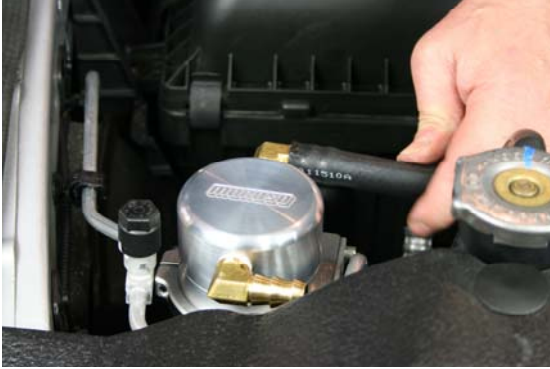
STEP 14 INSTALL 36" HOSE TO AIR OIL SEPARATOR