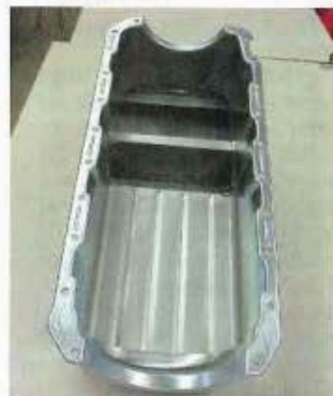
A Moroso pan will hold the oil and cover up the billet Moroso pump.