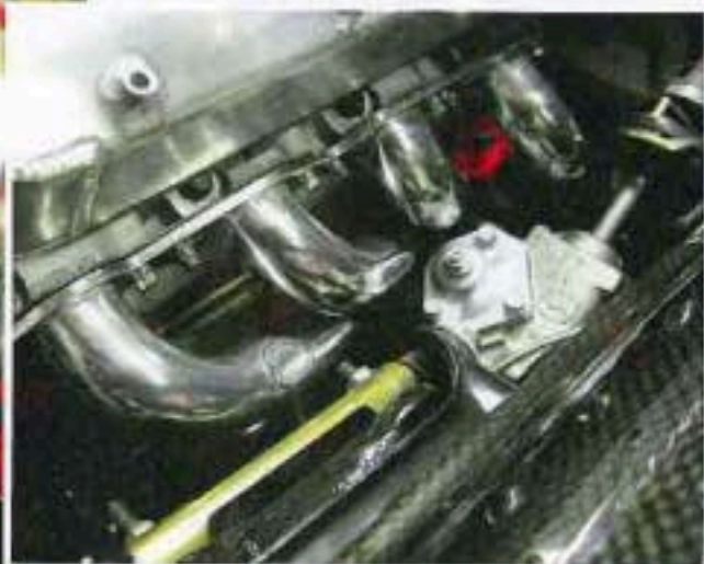
The 2-inch Hooker headers make for a tight fit with the big-block but slipped in nicely.