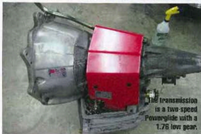
The transmission is a two-speed Powerglide with a 1.76 low gear.