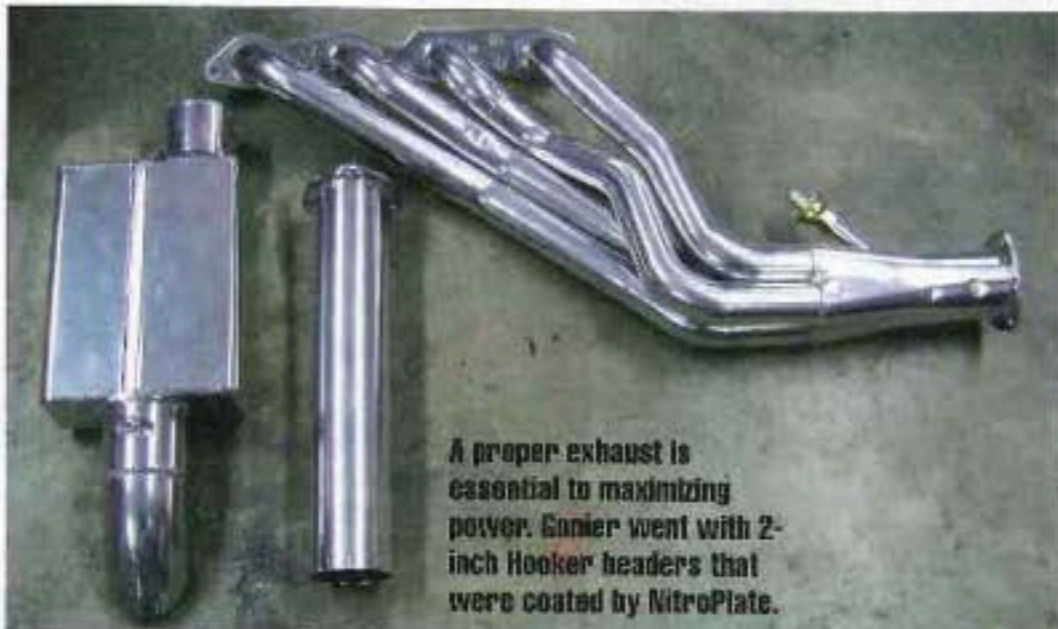
A proper exhaust is essential to maximizing power. Gonier went with 2-inch Hooker headers that were coated by NitroPlate.