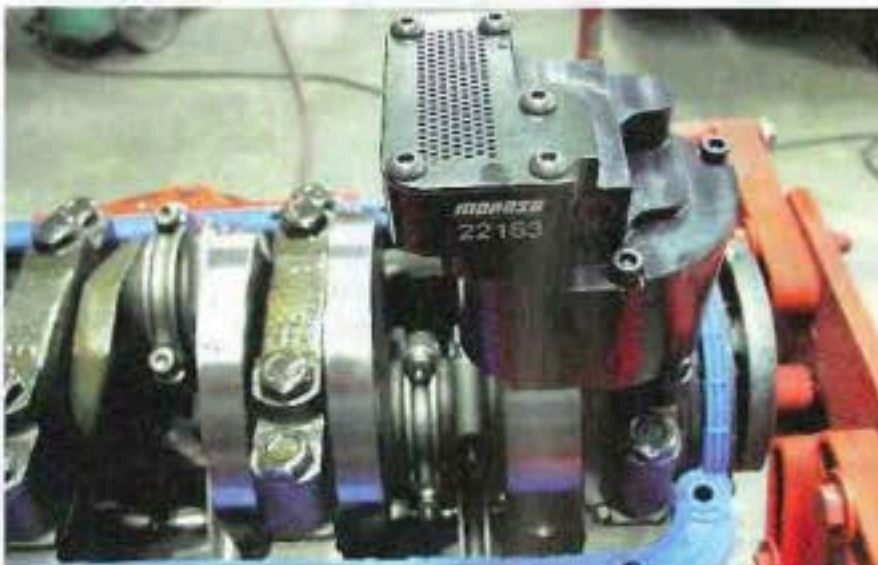
A punched-out 454 (.060-inch over) will power the Nova (hopefully into the high nines).