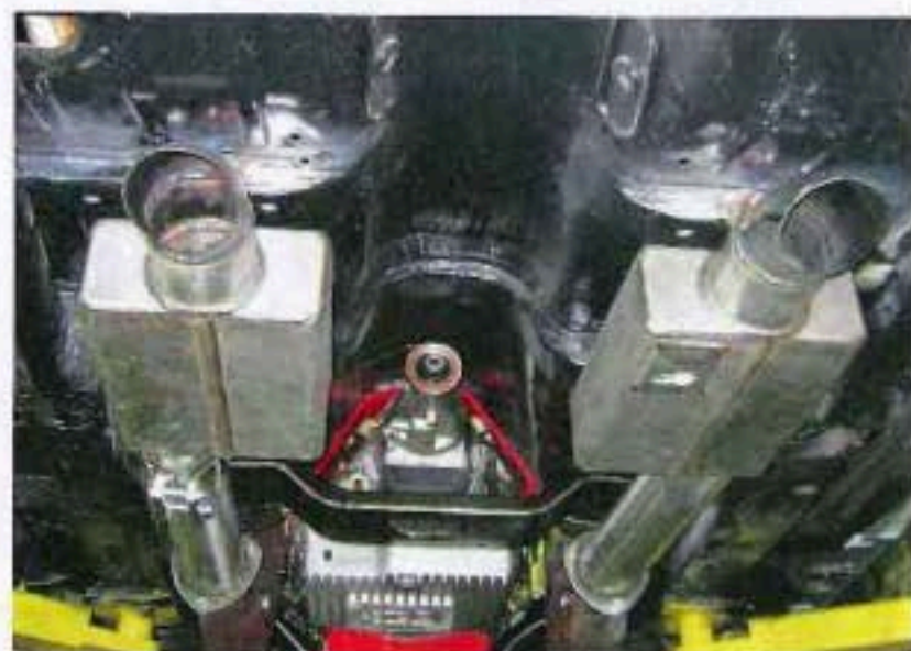
The headers feed a pair of 3-inch Spintech mufflers.