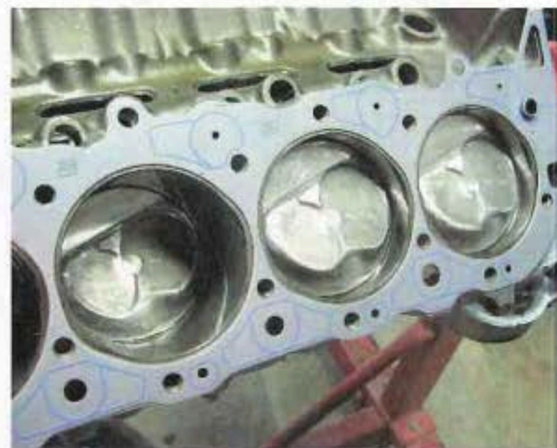
JE pistons will give the big-block 12:1 compression.