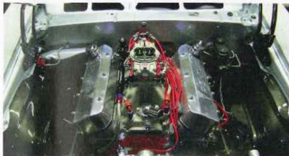
Notice some of the show-car details, such as the smooth firewall and the carbon-fiber look on the fiberglass inner fenders.