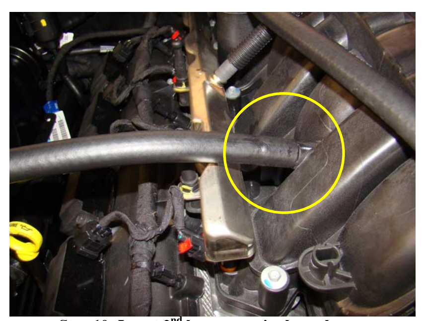
Step 10: Insert 2<sup>nd</sup> hose over nipple as shown.