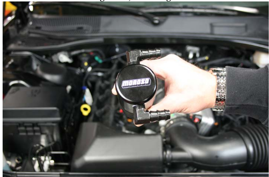
Step 6: Install fittings in Air Oil Separator as shown using Teflon Tape.

Step 5: Install billet clamp using (2) \frac{1}{4} -20 x 5/8 SHCS, make sure relief groove is facing down, do not tighten.