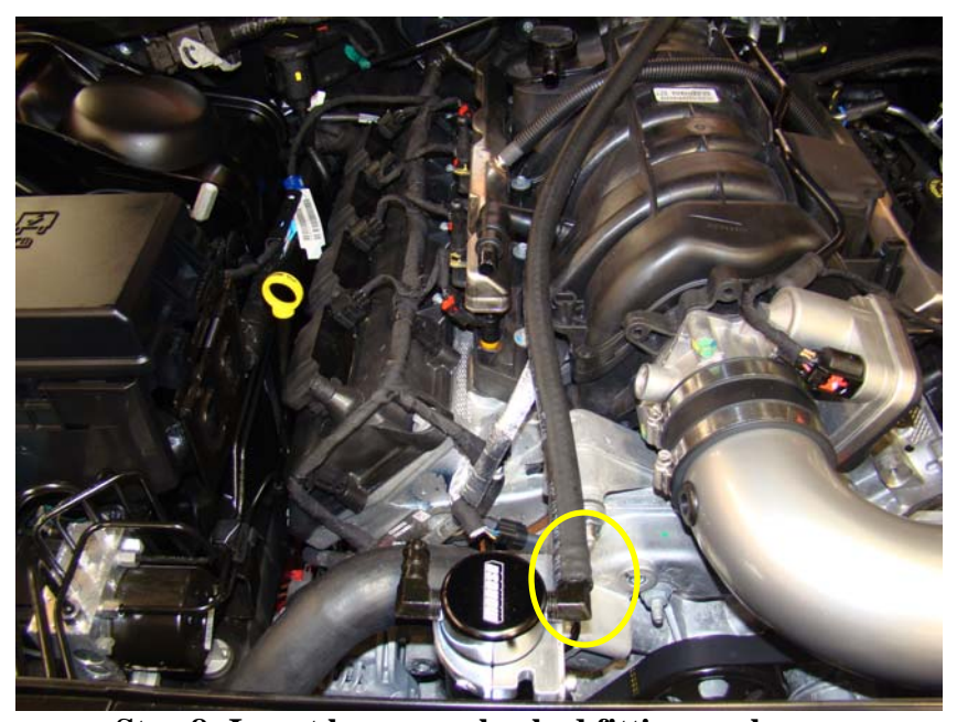
Step 8: Insert hose over barbed fitting as shown.