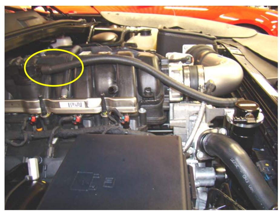
Step 9: Insert other end of hose over PCV nipple as shown.