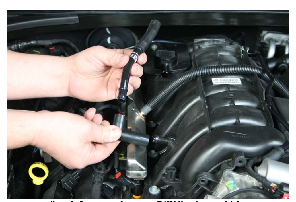
Step 2: Locate and remove PCV line from vehicle.