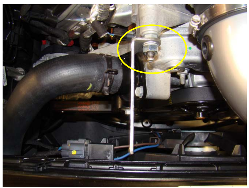
Step 3: Install stainless mounting bracket using 10mm nut, flat washer and lock washer as shown.