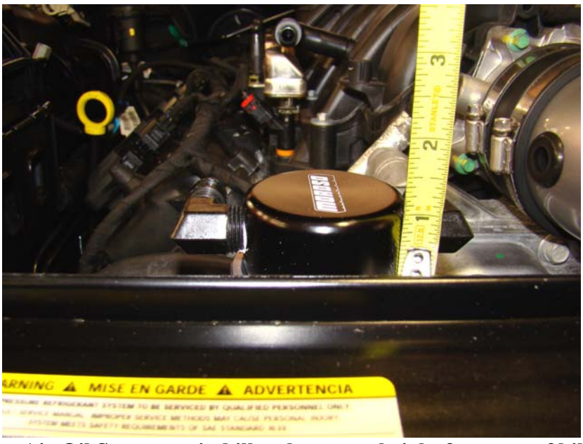
Step 7: Insert Air Oil Separator in billet clamp, set height from top of billet clamp to top of Separator to 1" to 1 1/8". Make sure bottom cup can be unscrewed.