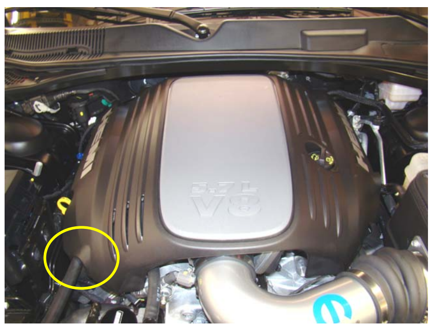
Step 11: Re-install engine cover and route hose to Air Oil Separator.