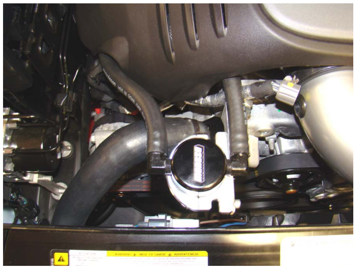
Step 12: Insert hose over barbed fitting.