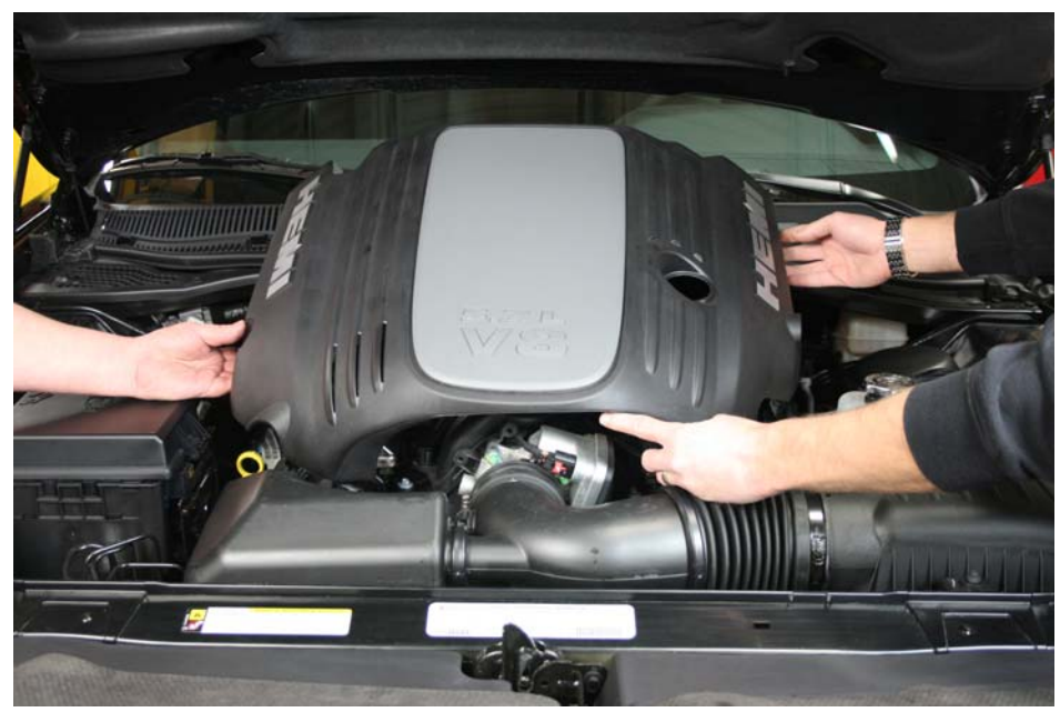
Step1: Remove engine cover.