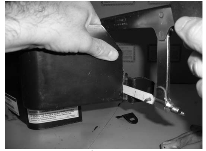
Figure 2 Figure 3