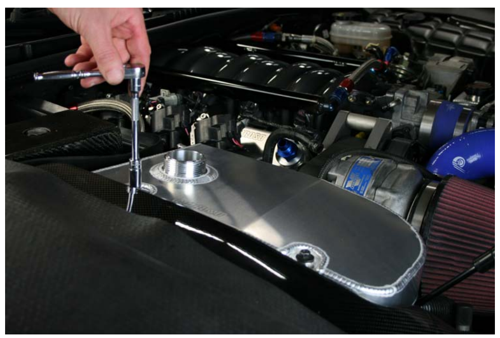
Step 10: Place tank over studs and reinstall top (2) mounting nuts