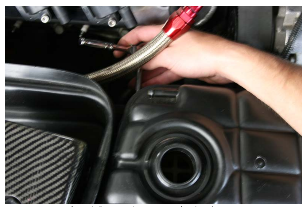
Step 4: Remove lower mounting bracket nut