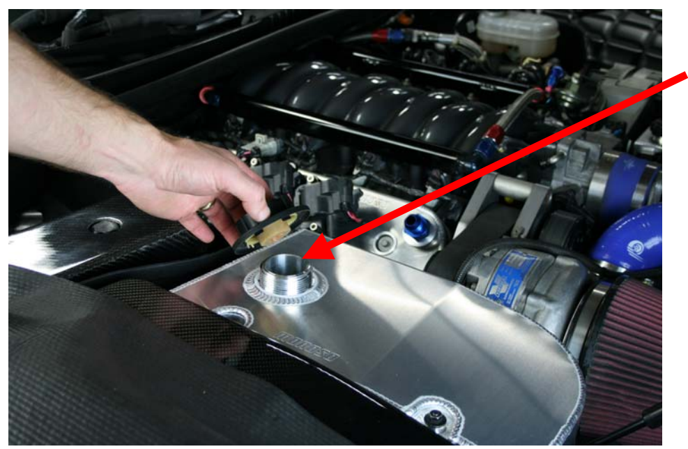
Step 13: Fill with fluid, 2"-2 1/4" down from outside lip of billet neck