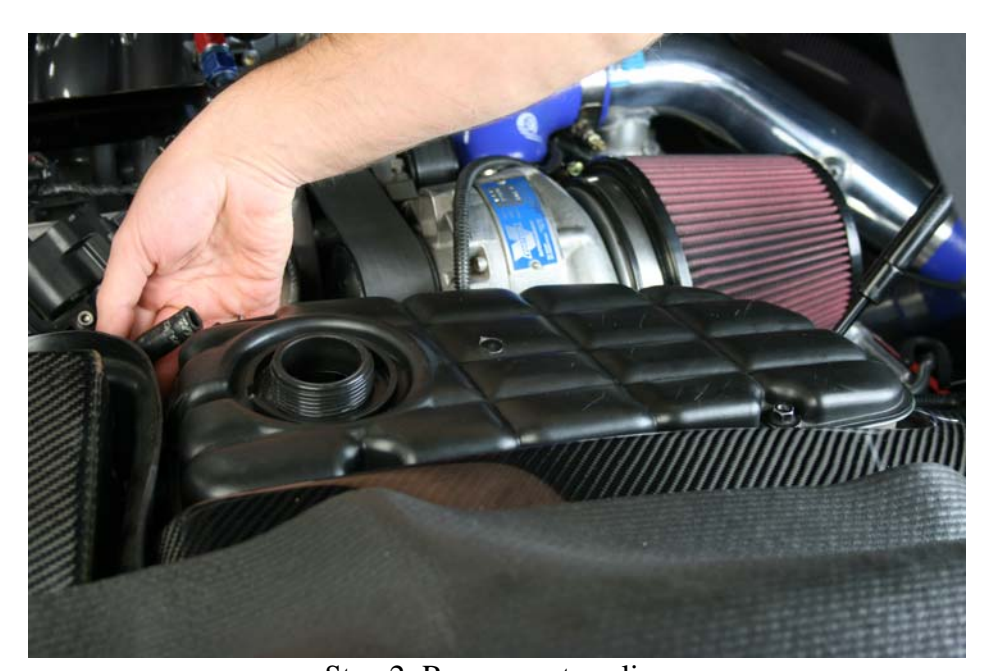
Step 2: Remove return line