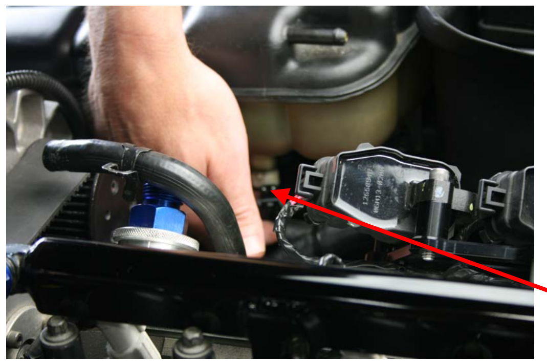
Step 5: Remove fluid sensor plug from bottom of tank (does not apply to all years)