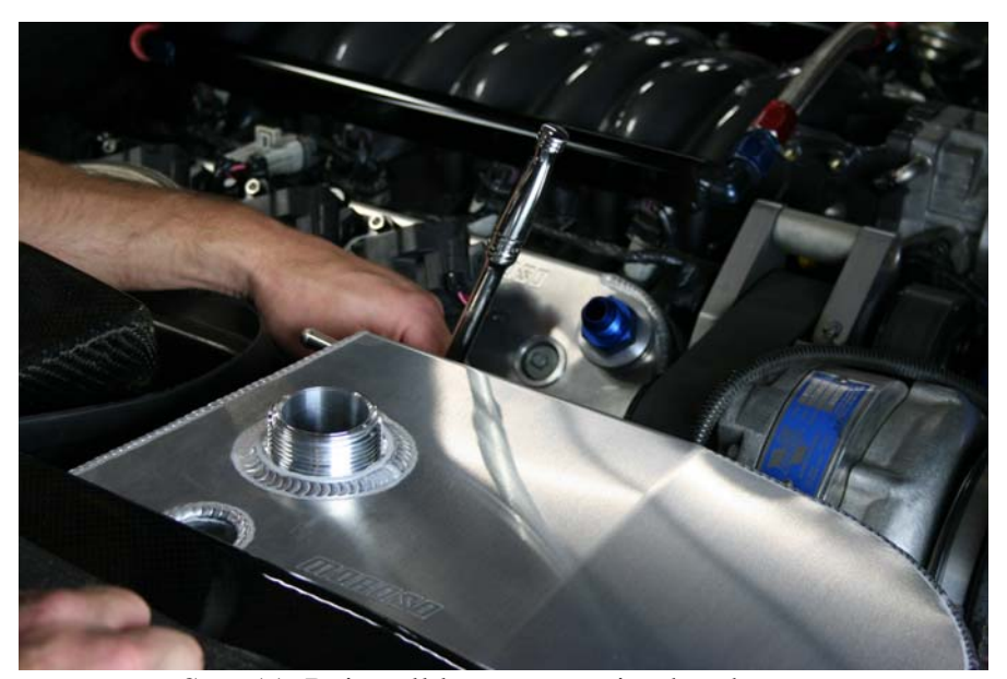
Step 11: Reinstall lower mounting bracket nut