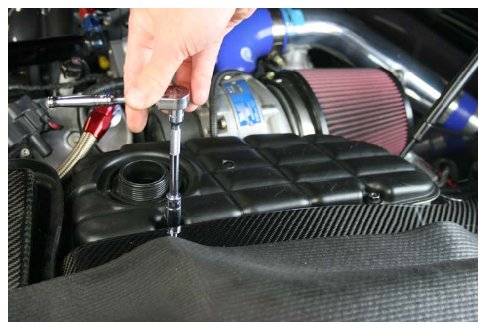
Step 3: Remove top (2) mounting nuts