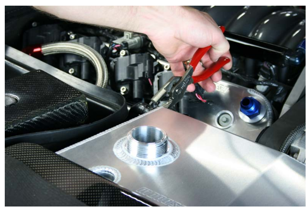
Step 12: Reinstall return line