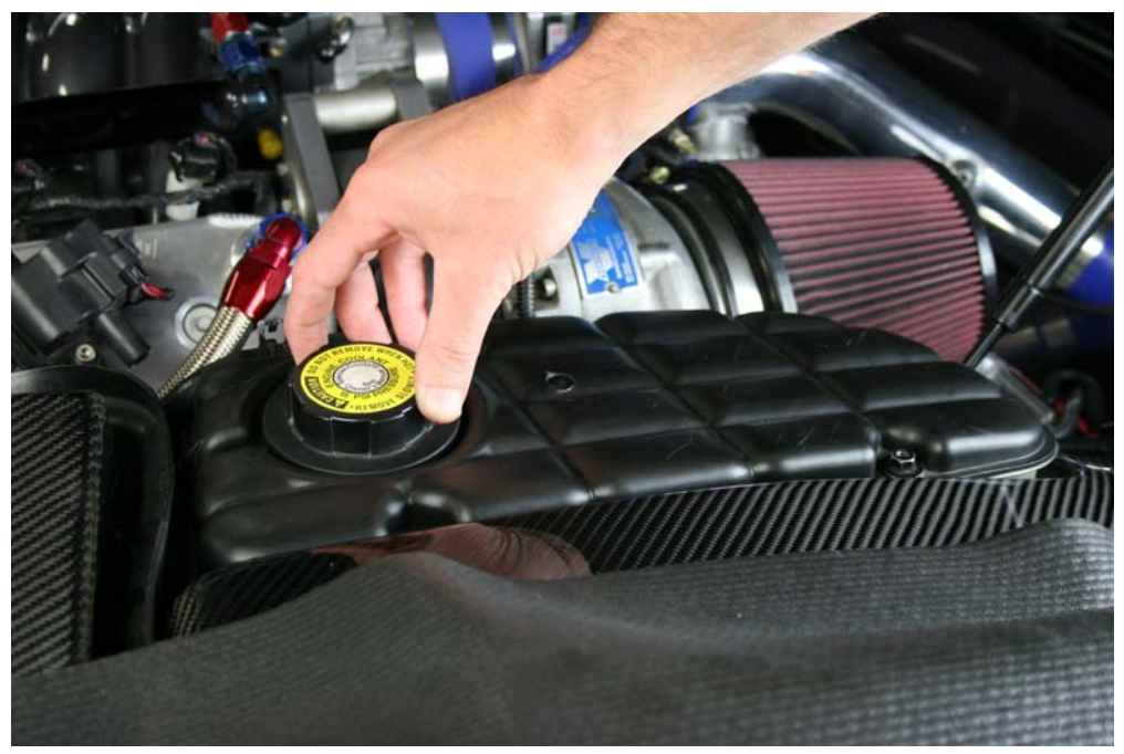
Step 1: Remove cap and drain as much fluid as possible