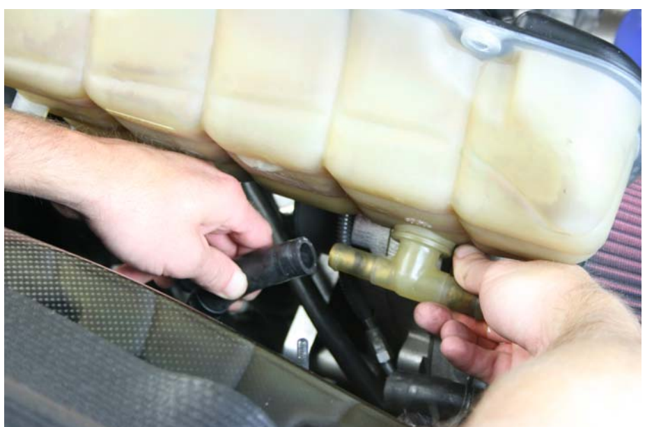
Step 7: Remove supply hoses from tank and remove tank from vehicle