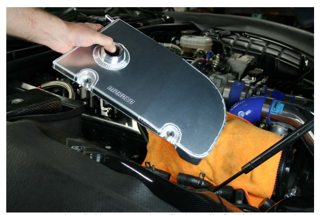
Step 8: Place new tank on fender well of vehicle