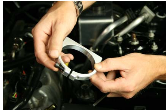
STEP 7 INSTALL 1/4X20X1

For Technical Assistance, call Moroso's Tech Line (203)-458-0542, 8:30am-5:00pm Eastern Time MOROSO PERFORMANCE PRODUCTS, INC. 80 CARTER DRIVE GUILFORD, CT 06437 www.moroso.com