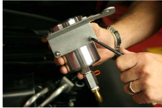
STEP 9 INSTALL STAINLESS BRACKET