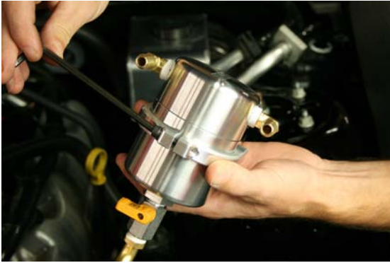
STEP 8 INSTALL BILLET CLAMP