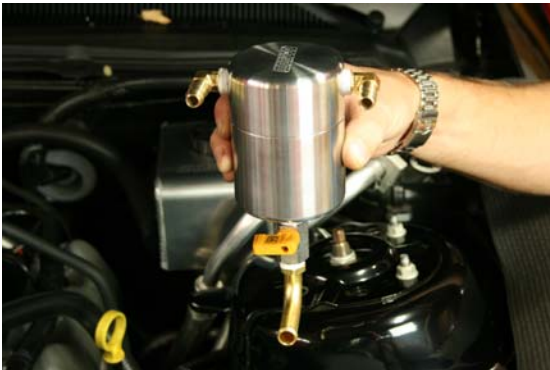
STEP 6 ASSEMBLE TANK AS SHOWN APPLY TEFLON TAPE TO ALL FITTINGS