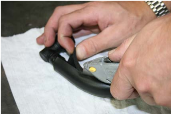
STEP 12 CUT INSULATION FROM PCV TUBE