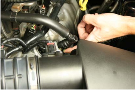
STEP 2 REMOVE 90 DEGREE FITTING OF PCV TUBE