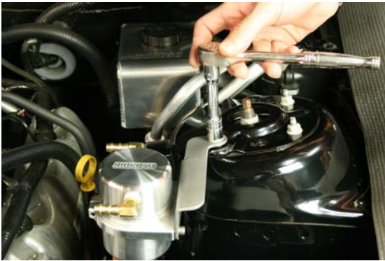
STEP 10 INSTALL ASSEMBLY