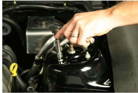
STEP 5 REMOVE STRUT TOWER NUT ON DRIVERS SIDE