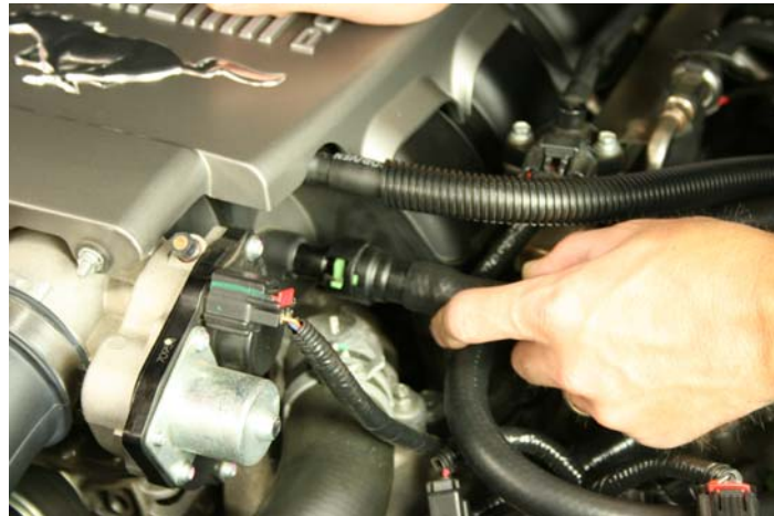
STEP 18 INSTALL STRAIGHT END FITTING INTO INTAKE