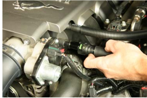
STEP 3 REMOVE STRAIGHT FITTING OF PCV TUBE