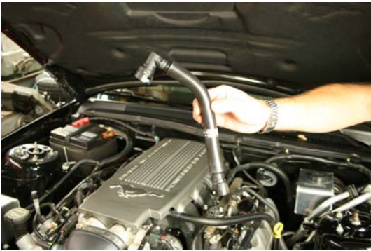
STEP 4 REMOVE PCV TUBE