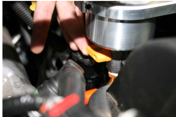
STEP 20 VERIFY THAT BALL VALVE IS CLOSED

For Technical Assistance, call Moroso's Tech Line (203)-458-0542, 8:30am-5:00pm Eastern Time MOROSO PERFORMANCE PRODUCTS, INC.