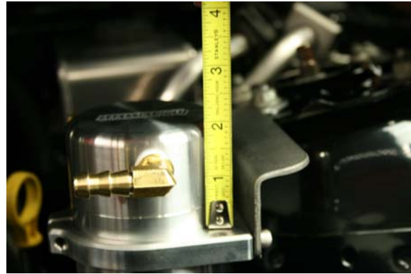
STEP 11 ADJUST CLAMP TO BODY TO APROX. 2"