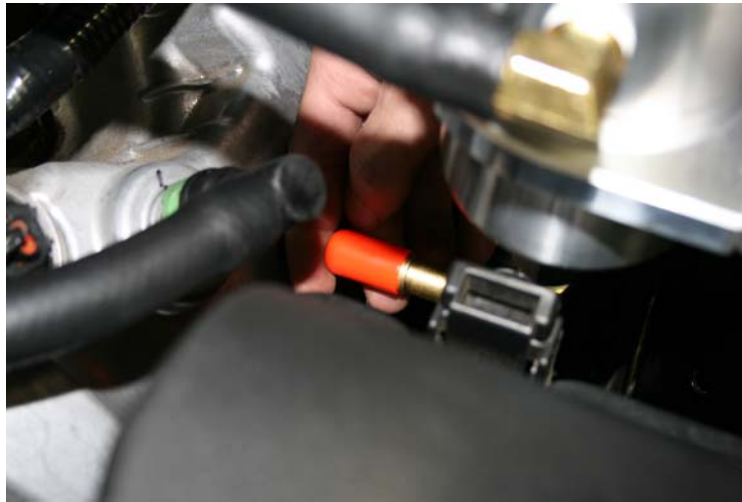
STEP 19 INSTALL DRAIN CAP AS SHOWN