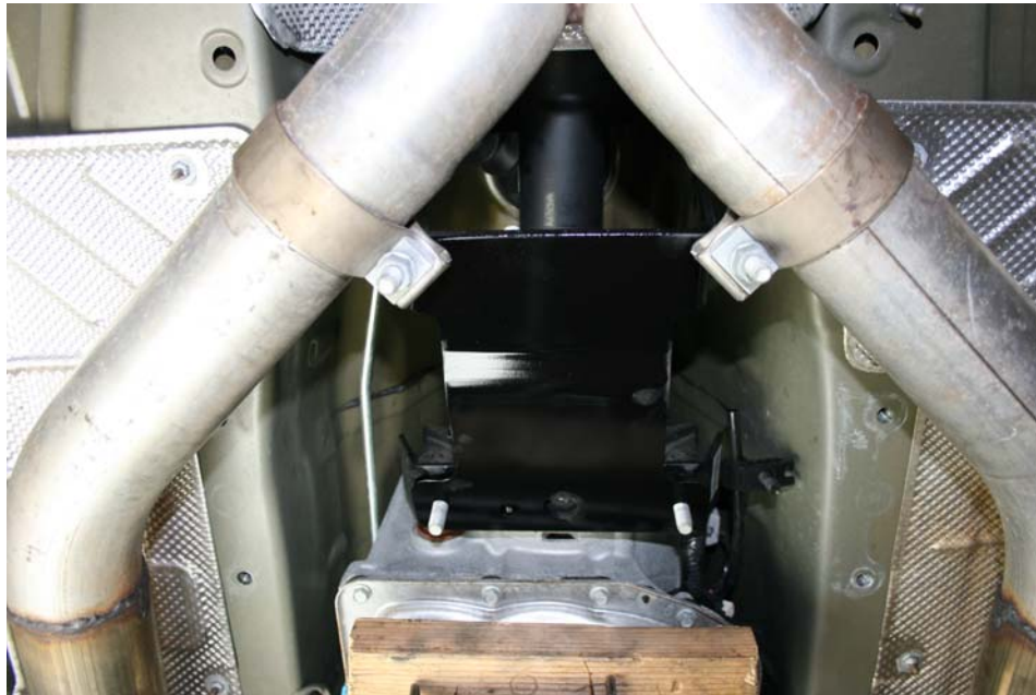
Step 6: Place drive shaft base plate over transmission mount bolts

For Technical Assistance, call Moroso's Tech Line (203)-458-0542, 8:30am-5:00pm Eastern Time MOROSO PERFORMANCE PRODUCTS, INC.