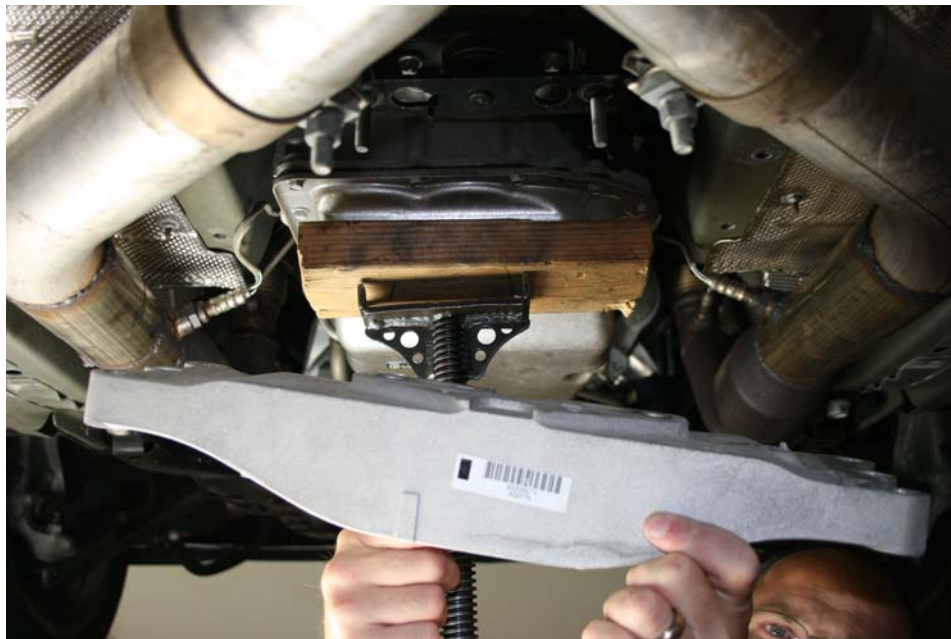
Step 4: Remove transmission crossmember from vehicle

For Technical Assistance, call Moroso's Tech Line (203)-458-0542, 8:30am-5:00pm Eastern Time MOROSO PERFORMANCE PRODUCTS, INC.