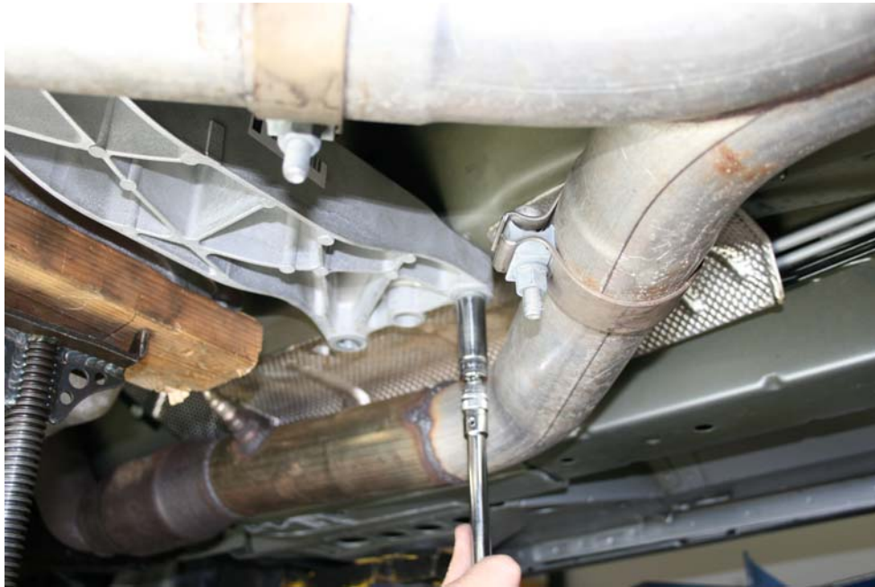
Step 3: Remove transmission crossmember bolts