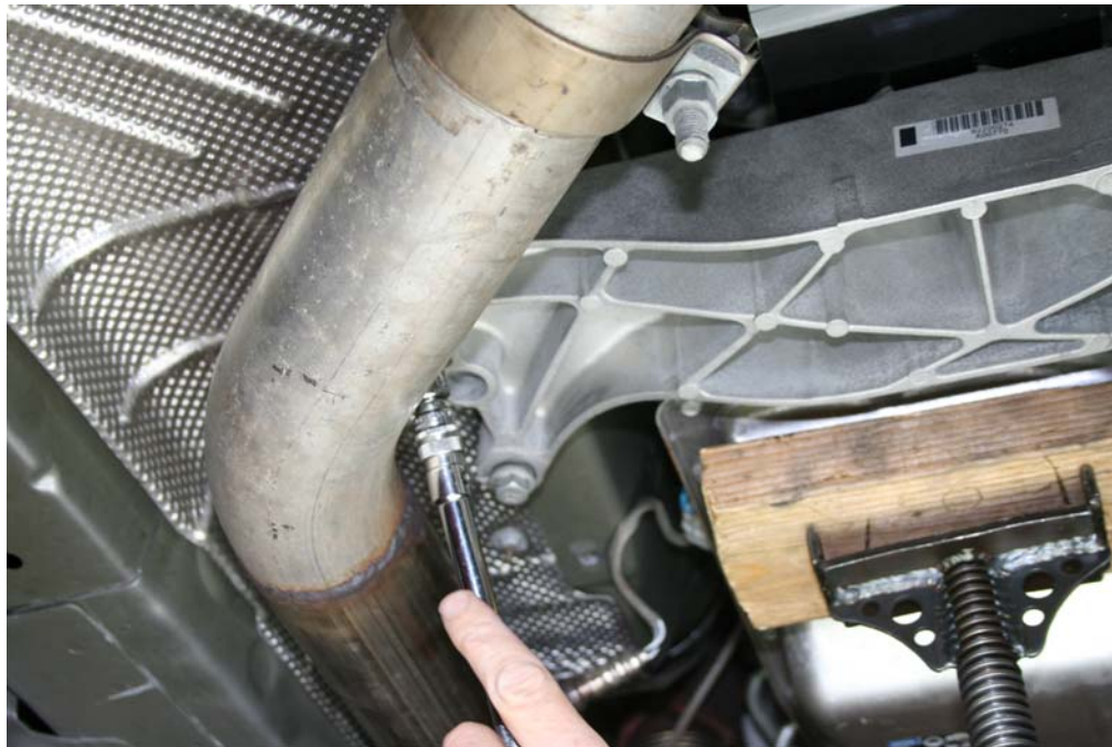
Step 8: Reinstall remaining crossmember bolts and tighten