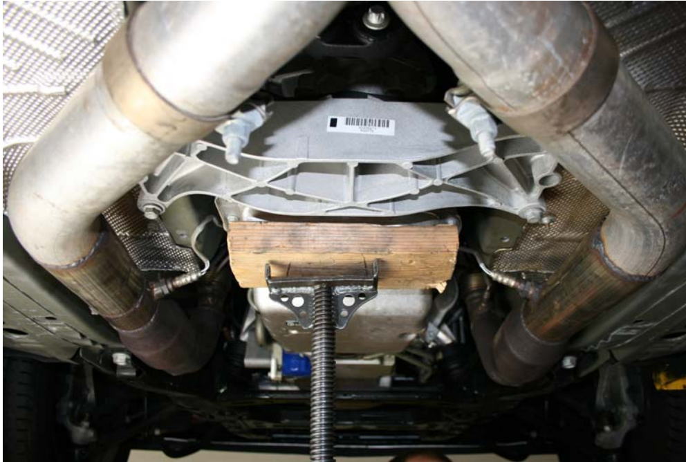
Step 1: Rear of transmission must be supported using a suitable jack