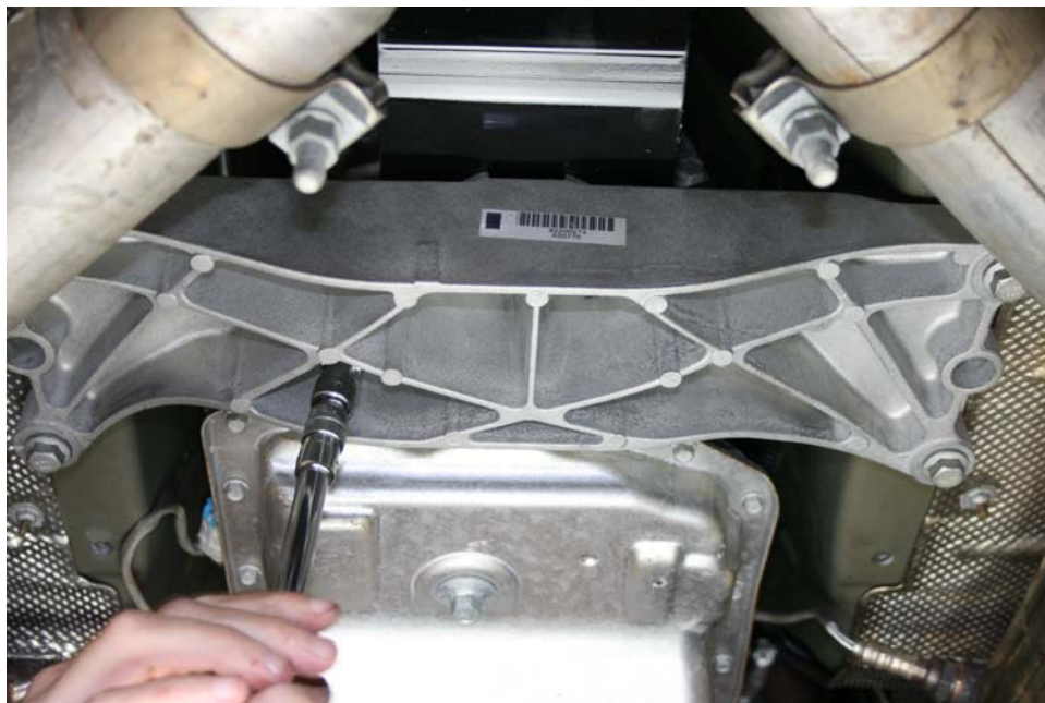
Step 9: Reinstall and tighten transmission mount bolts

For Technical Assistance, call Moroso's Tech Line (203)-458-0542, 8:30am-5:00pm Eastern Time MOROSO PERFORMANCE PRODUCTS, INC.