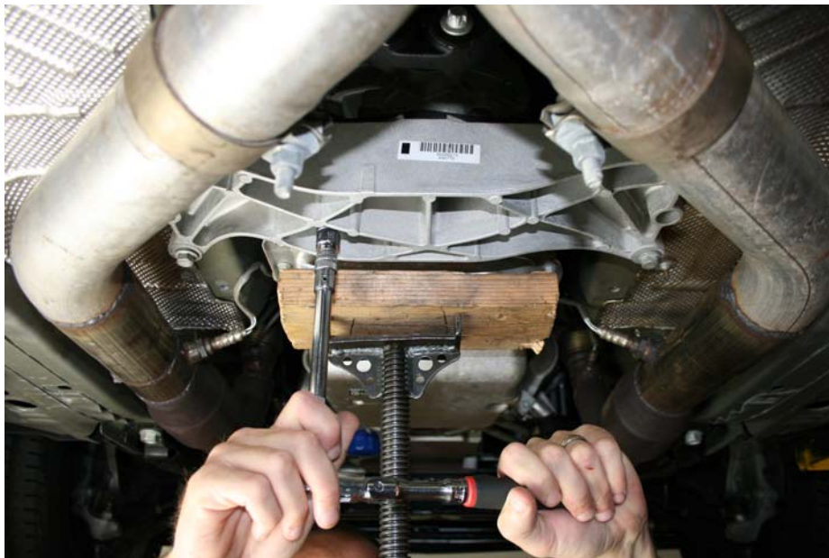
Step 2: Remove transmission mount bolts

For Technical Assistance, call Moroso's Tech Line (203)-458-0542, 8:30am-5:00pm Eastern Time MOROSO PERFORMANCE PRODUCTS, INC.