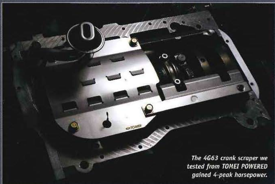
The 4G63 crank scraper we tested from TOMEI POWERED gained 4-peak horsepower.

A crank scraper is a piece of metal that is positioned very near the path of a spinning crankshaft. While the scraper does not come into physical contact with the rotating assembly, it is positioned incredibly close. As the rotating assembly passes by the scraper, the excess oil (that fills the gap between the rotating assembly and the scraper) is removed. Once removed, the oil is directed down into the pan towards the oil pump sump. Since the crank scraper acts as a physical barrier between the oil in the pan and the rotating assembly, it prevents the oil from being atomized into a cloud and keeps any aerated oil away from the oil pickup.