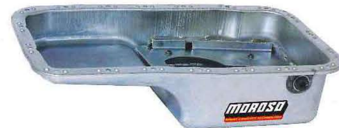
These Honda application pans show the differing pan capacity requirements of wet-(top) and dry-(bottom) sump systems.