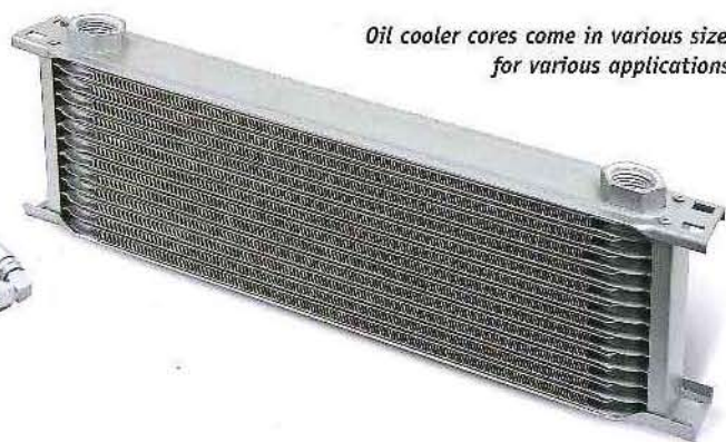
Oil cooler cores come in various sizes for various applications.

viscosity and shear strength, the chances of damaging metal-to-metal contact increase. Aftermarket oil coolers reduce oil temperatures allowing the engine oil to maintain its viscosity for optimum protection and longevity.