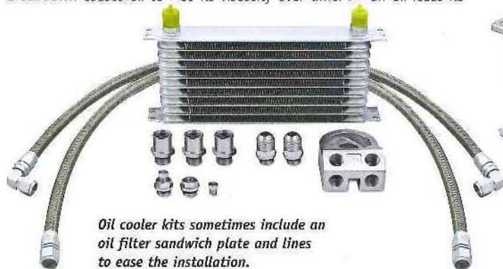
Oil cooler kits sometimes include an oil filter sandwich plate and lines to ease the installation.

For the internal components of the engine, heat is the enemy. The more horsepower an engine makes, the more heat it creates. Thermal breakdown causes oil to lose its viscosity over time. As an oil loses its