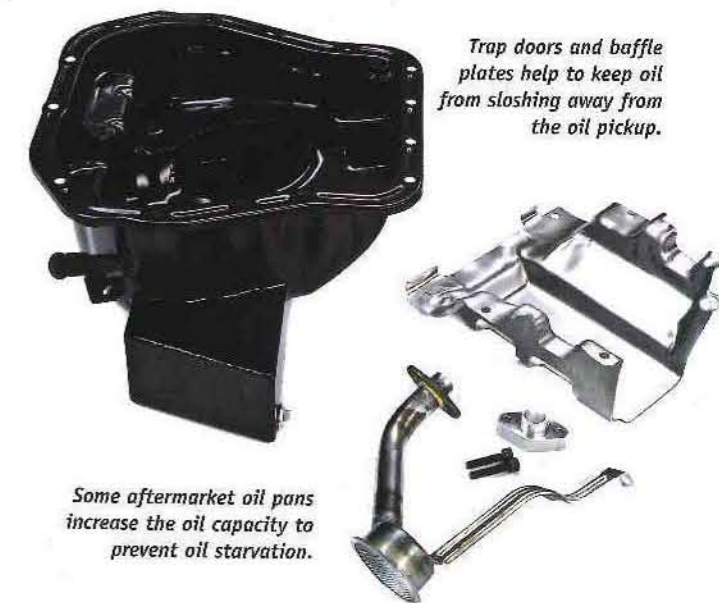
Trap doors and baffle plates help to keep oil from sloshing away from the oil pickup.